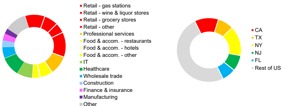
Diversification by State