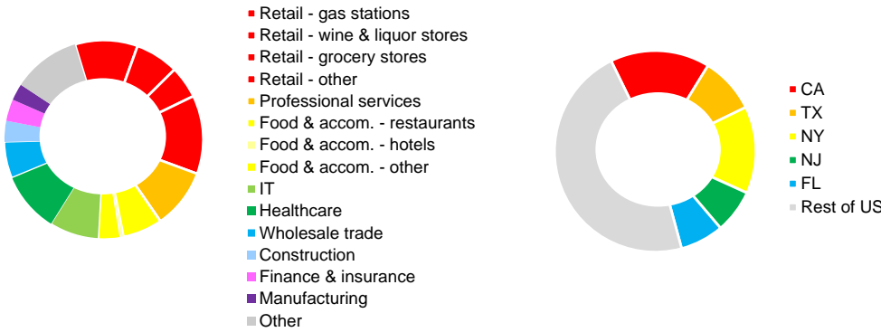
Diversification by State